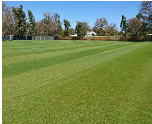
Programs & Tips